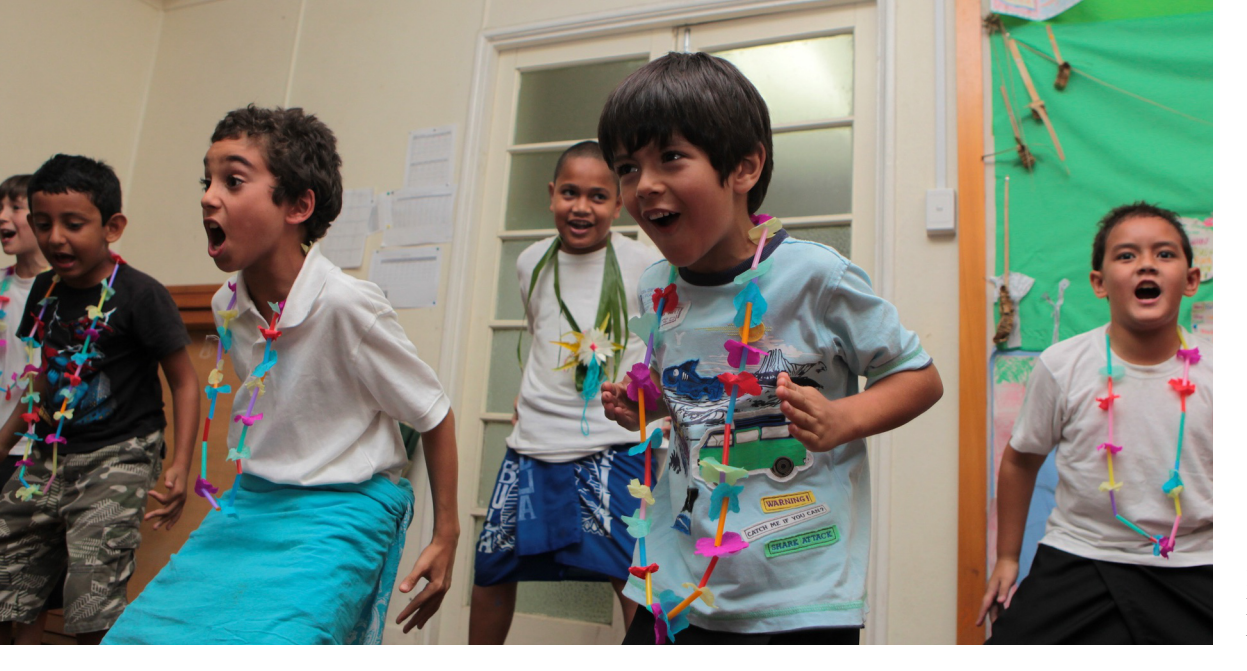
Evening performance leads to a NZ baka by the boys.